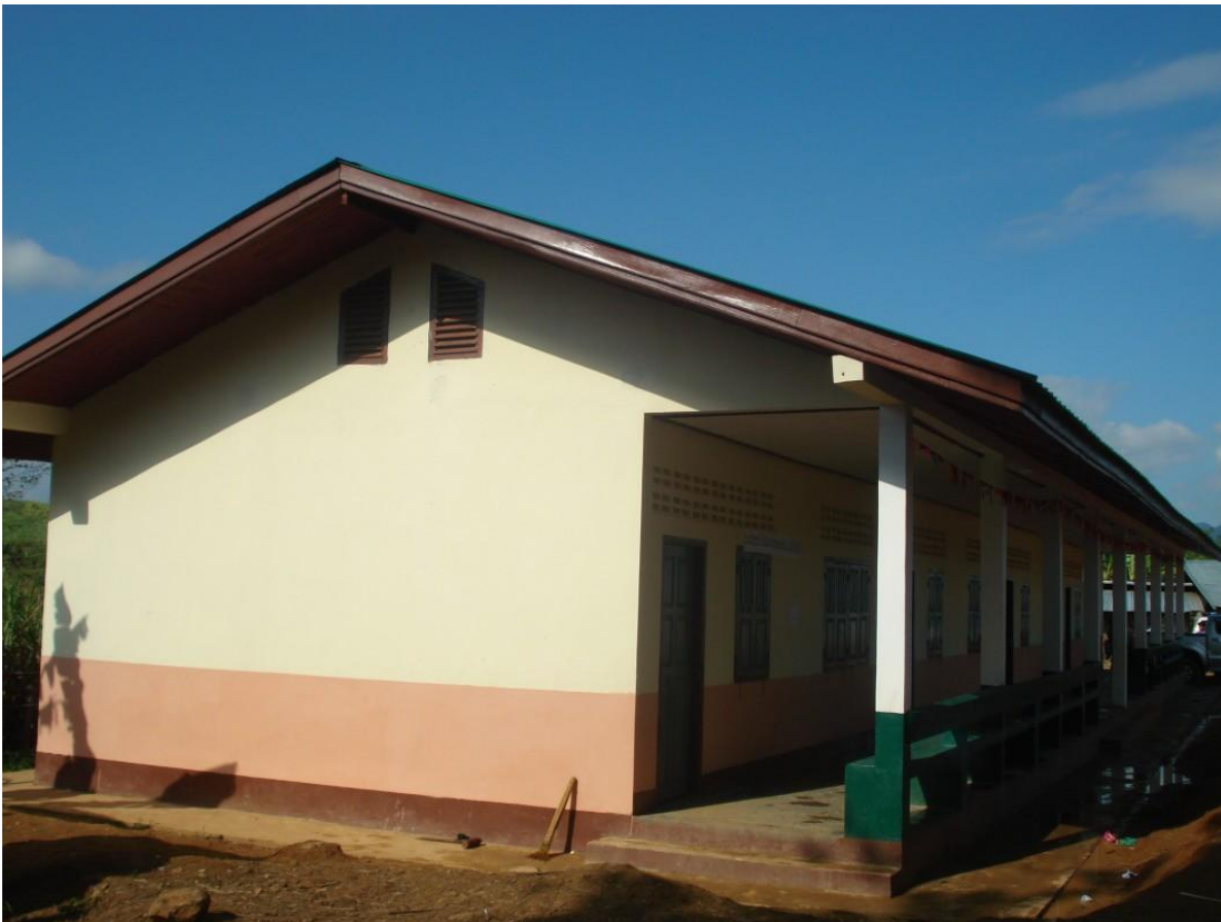
Overview of the new school building