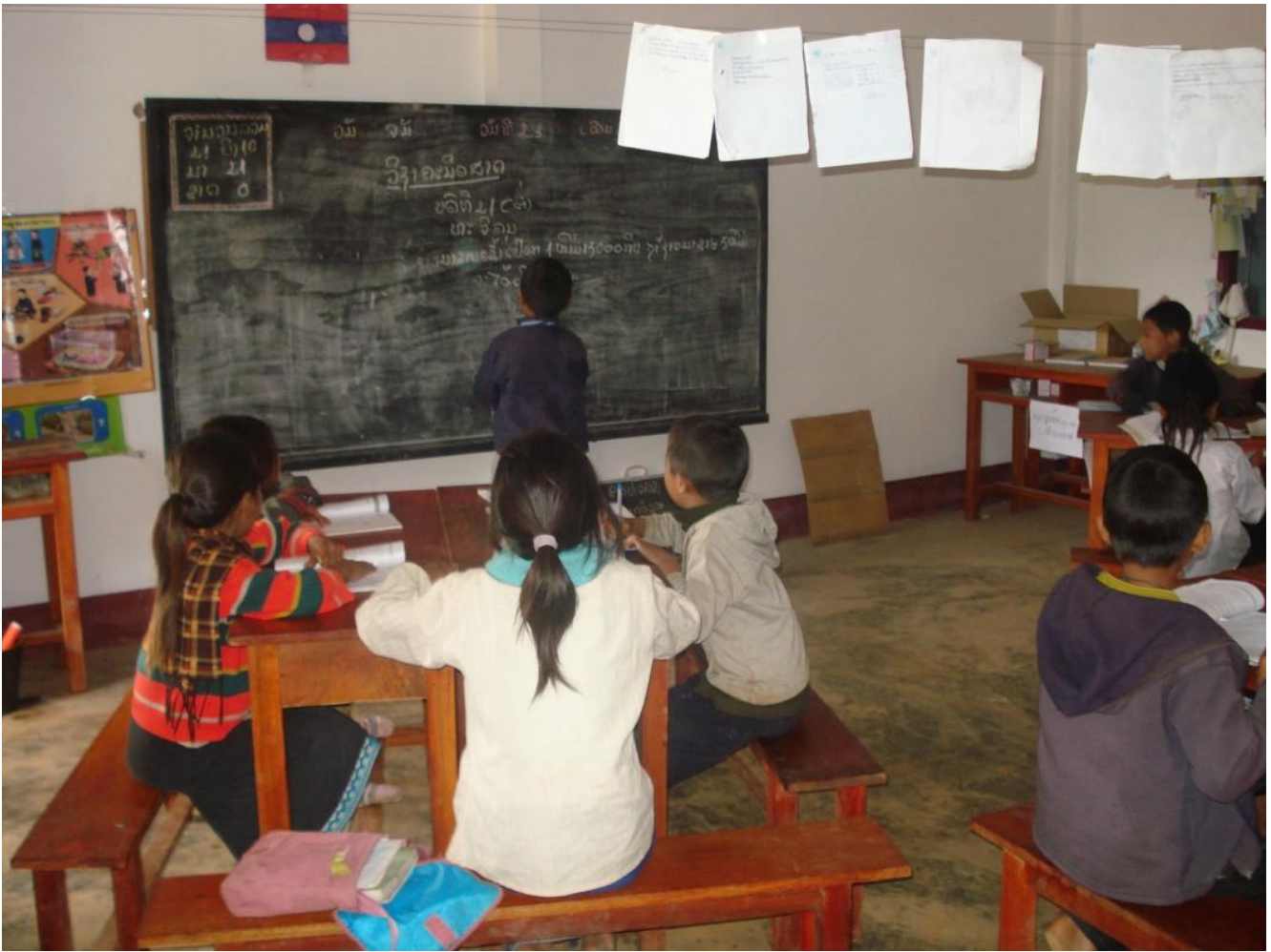
Children in math class