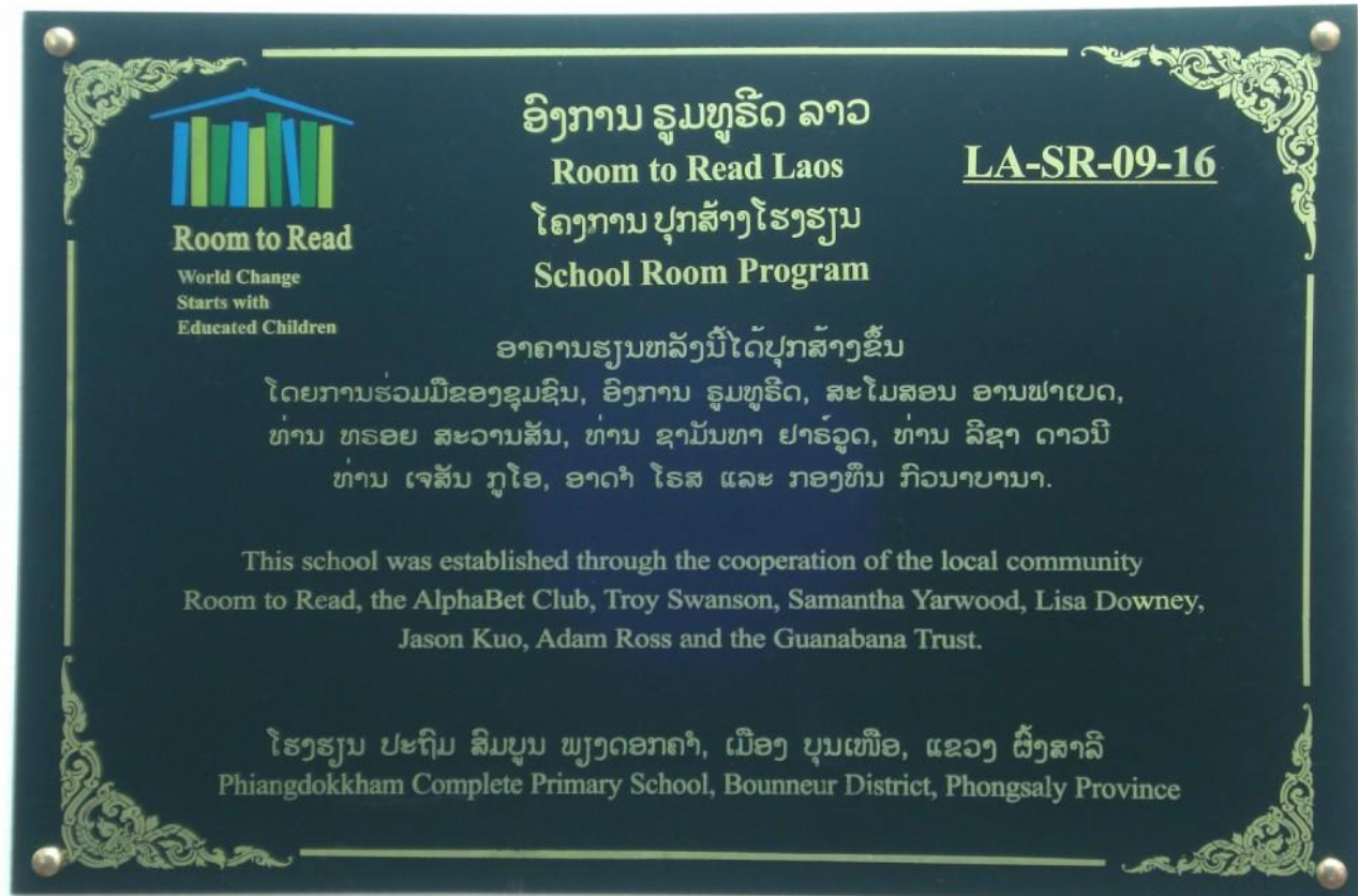
The dedication plaque for the new school