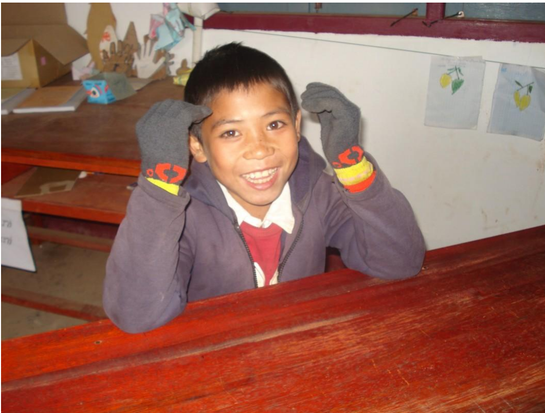
A smiling boy displays his new gloves