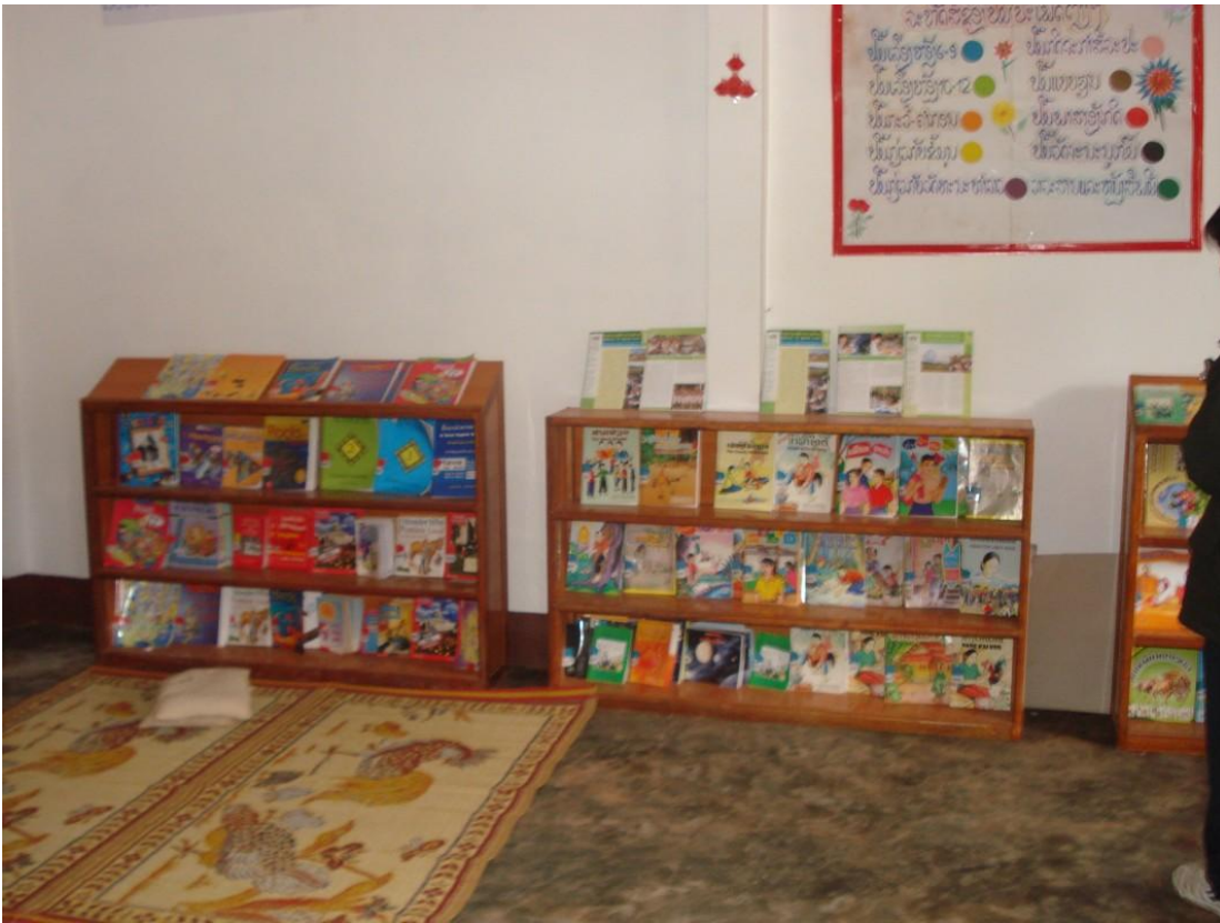
The library room in the new school